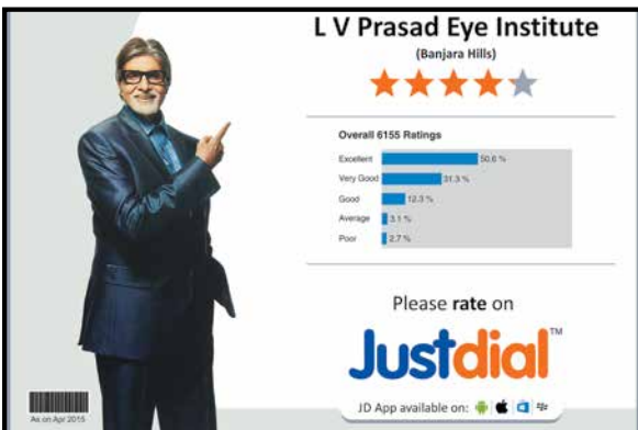
Rated 4 on a scale of 5 by Customers on Justdial ; April 2015.