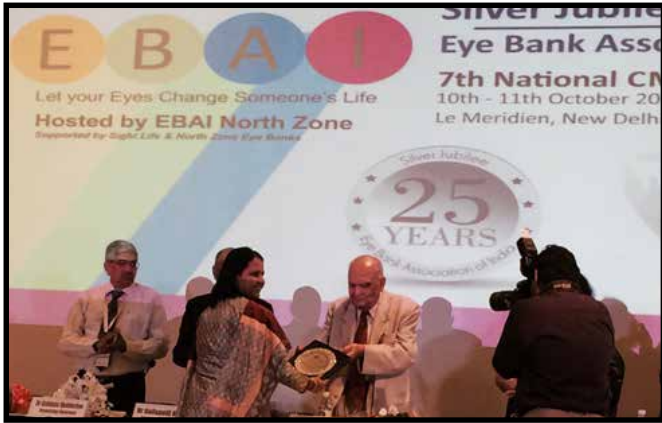
Ramayamma International Eye Bank was awarded the Best Eye Bank in India , for the highest number of corneas procured in the year 2014-15 by Eye Bank Association of India. LVPEI was felicitated for achieving a record 20,000 transplants by a single institute; October 2015.