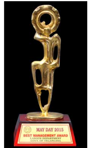
LVPEI received the " Best Management Award " given by the Labour Employment Training and Factories Department, Government of Telangana; May 2015.