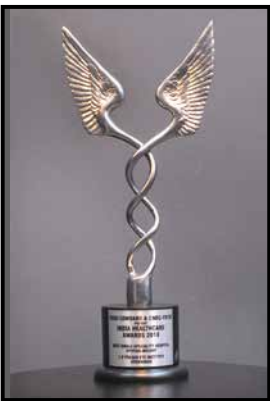
LVPEI won the India Healthcare Award , jointly instituted by CNBC TV18 and ICICI Lombard, in the category Best Single Specialty Hospital – Ophthalmology; June 2015.